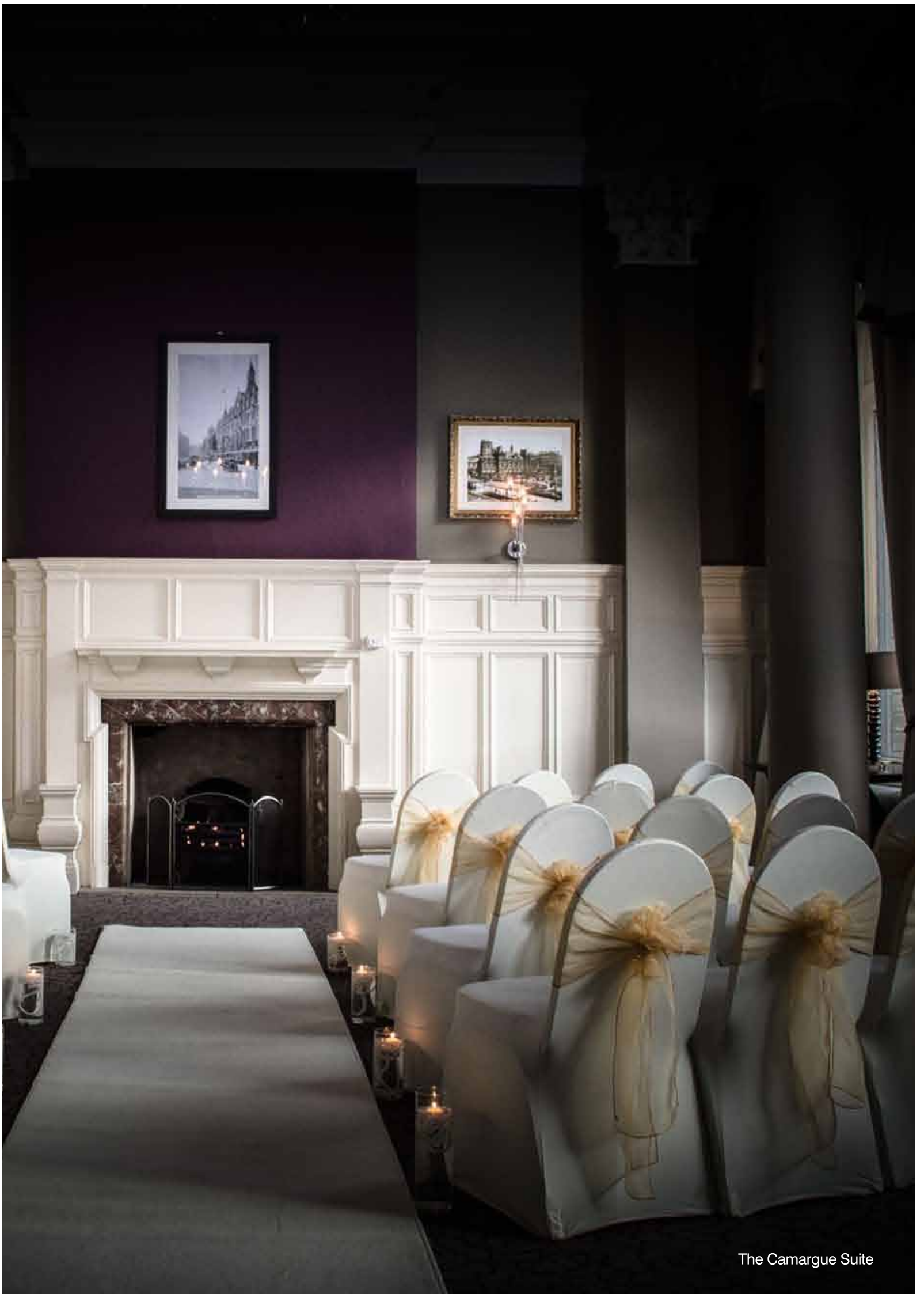
The Camargue Suite